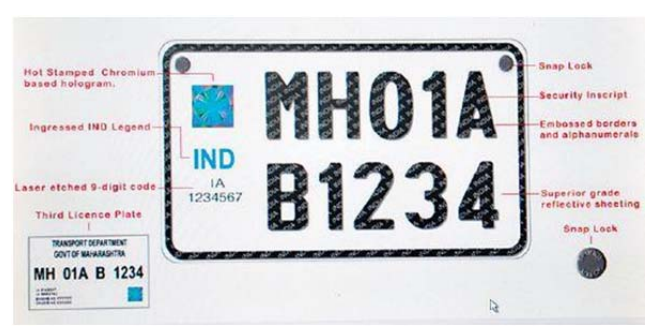
Fig 1. High Security Registration Plate.